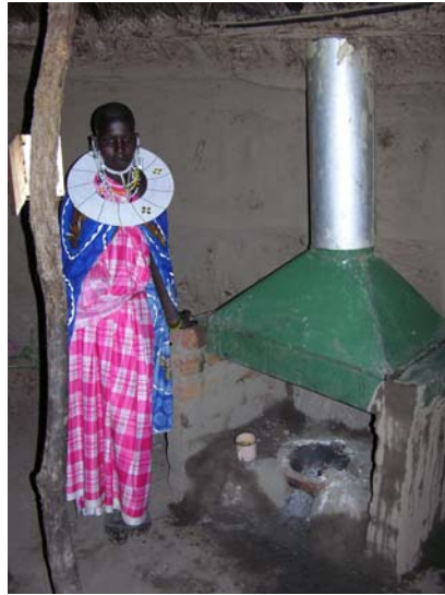
Figure 4: Maasai woman standing beside her smoke hood, Tanzania.

In Nepal, the traditional stove is a three-legged tripod with a circular metal ring on the top where the pots can sit. By building around the back of the stove, more heat is directed at the pot, increasing efficiency, whilst those sitting around the stove can still see the flames (Figure 3). The dry-stone walls of the houses have been insulated as part of the project, as shown around the smoke hood in Figure 3. This means that less heat goes out through the walls, compensating for the heat lost through the chimney in the vented smoke.