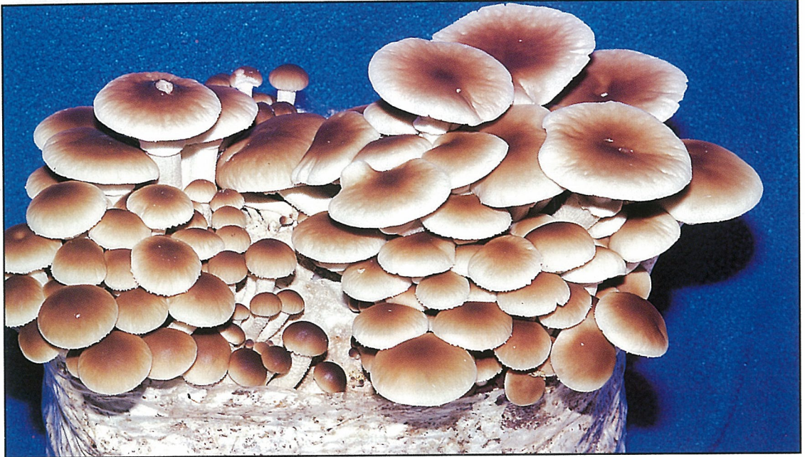
Plate 5. Agarocybe aegerita , the Black Poplar Mushroom or Yanagi-matsutake.