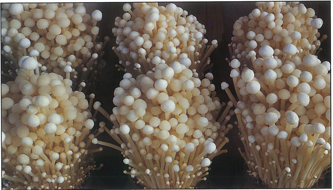
Plate 6. Flammulina velutipes , the Winter Mushroom or Enokitake.