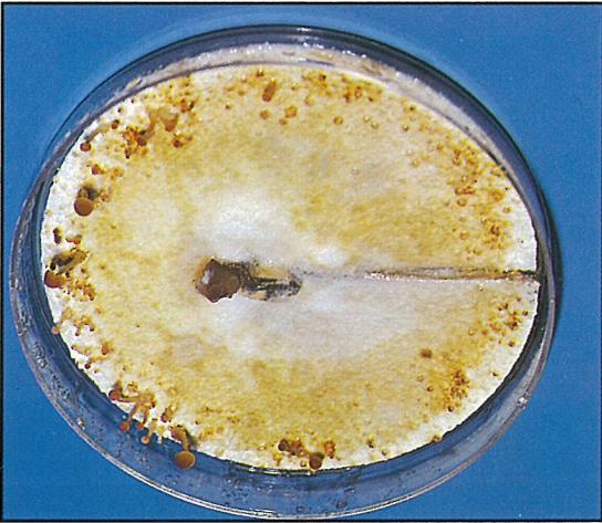
Plate 1. Fruiting culture of Agrocybe aegerita , the Black Poplar Mushroom.