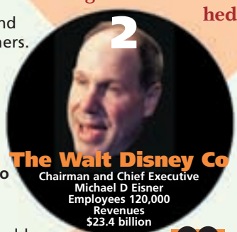
The Walt Disney Co Chairman and Chief Executive Michael D Eisner Employees 120,000 Revenues $23.4 billion

The Disney Channel broadcasts in 8 countries. International sports channel ESPN broadcasts to over 165 countries in Asia, Europe, Latin America. Other channels include Walt Disney TV, Sportsvision Australia and eight others.