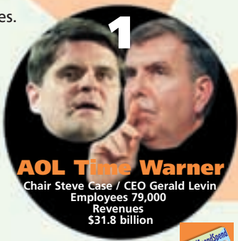
AOL Time Warner Chair Steve Case / CEO Gerald Levin Employees 79,000 Revenues $31.8 billion

'A vast empire of broadcasting, music, movies and publishing assets, complemented by AOL's dominant Internet presence, all fed to consumers ... through Time Warner's cable network. Think of it as AOL Time Warner Anywhere, Anytime, Anyhow,' – TIME magazine. 1