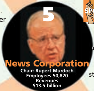
News Corporation Chair: Rupert Murdoch Employees 50,820 Revenues $13.5 billion

FOX News , and seven other US news networks. In the UK, BskyB, Sky with 150 channels and services. Australian channel FOXTEL . STAR TV satellite service reaches over 300 million people across Asia. Phoenix satellite TV and four other channels serve much of China. News Corp also broadcasts into India, Japan, Indonesia, New Zealand, Latin America, Europe.