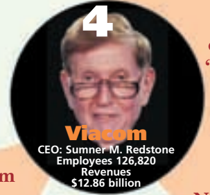
Viacom CEO: Sumner M. Redstone Employees 126,820 Revenues $12.86 billion

Viacom broke US rules controlling media ownership when it bought TV network CBS. Within a week, Senator McCain had proposed a change to those rules. Viacom is McCain's fourth biggest 'career patron' . 5